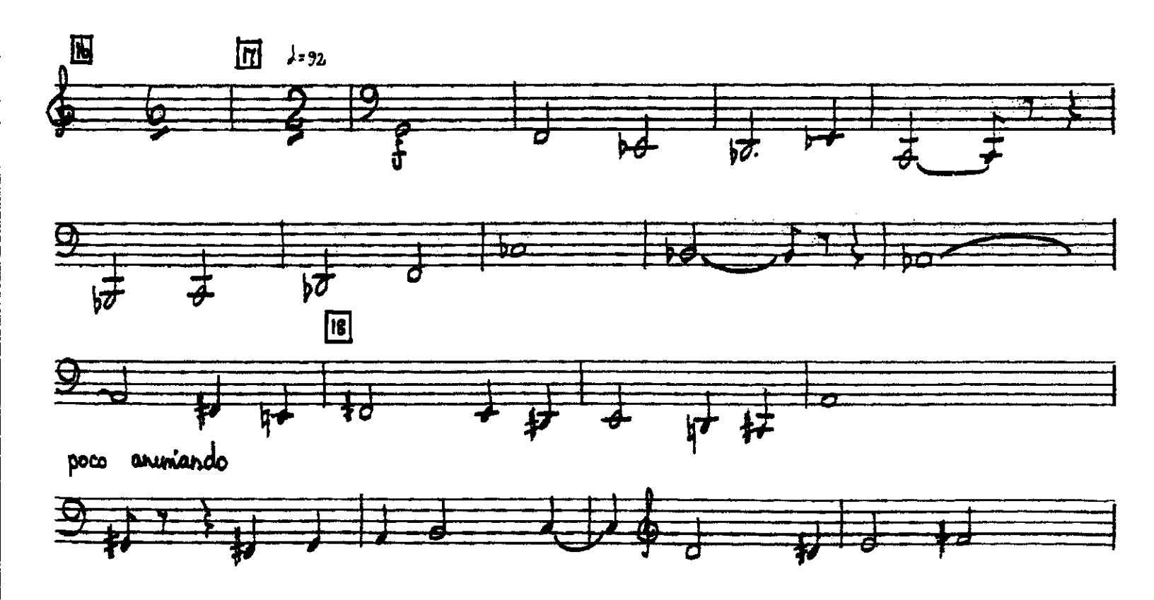
Horn 2 - Excerpt 1